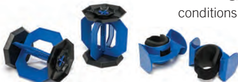
H2Xercise Bells and Fins.

Dr. McAvoy has developed exercise programs exclusively designed for Master Spas to help you get the most out of your swim spa and give you step-by-step activities with the H2Xercise book that will specifically help you reach your goals to a better quality of life. We include the H2Xercise book with each swim spa, along with the H2Xercise System which includes a rowing kit, resistance bands, dumbbells and ankle fins to maximize your exercise and fitness results.*