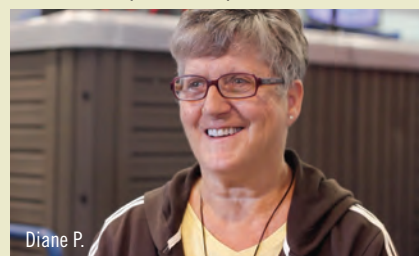
Michael Phelps Swim Spa user

“ I had been the primary caregiver for my husband suffering from cancer until his death in 2013. During that time, my own health was deteriorating and I became overweight. Since the loss of my husband, I decided to do something about it and my doctor suggested warm water exercise for my health issues and for weight loss. When I heard about Michael Phelps Swim Spas by Master Spas, I knew that was the perfect thing for me.