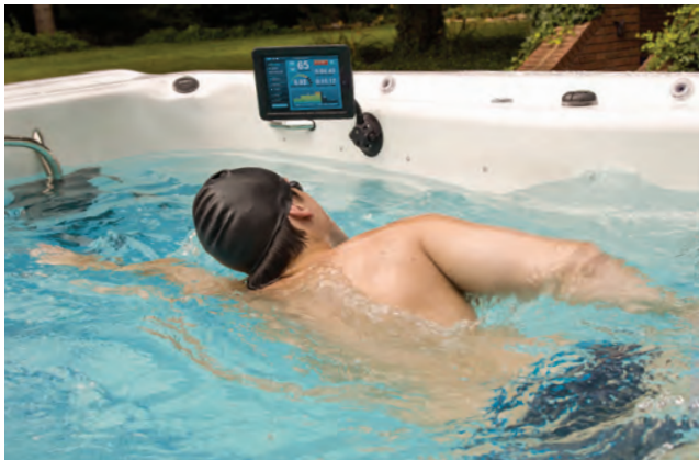
A swimmer monitors his workout with the SwimNumber iPad App.

choose your personal level of resistance depending on your workout.